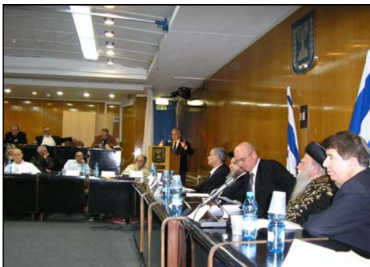
Knesset Conference Jerusalem

In March 22 nd 2005 a conference was held in the Knesset together with The Labour Party.